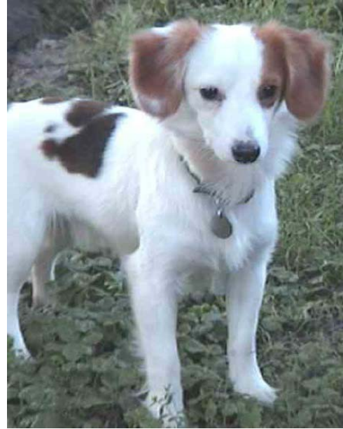
Joey was one of the dogs rescued from a hoarder.

Two hours after workers entered the sheds, they finished packing the